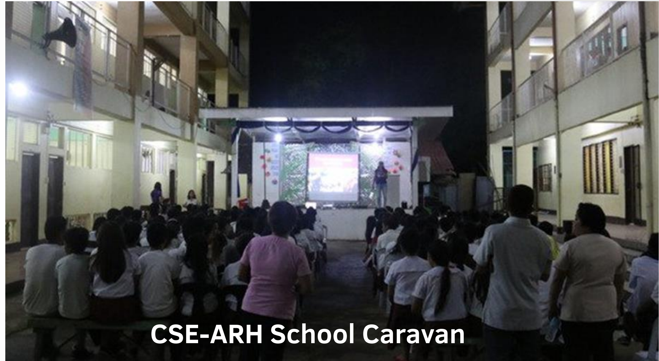
CSE-ARH School Caravan

“Kamo ra ang nianhi sa among eskwelahan para ani nga seminar..”